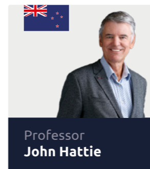
Professor John Hattie