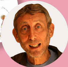
Michael Rosen Famous Children's Author