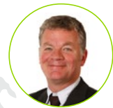
Sir Kevan Collins

Vision 2030: A Decade of Implementation Gearing up for ten years of raising teaching standards