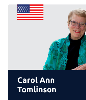
Leading Equality For All