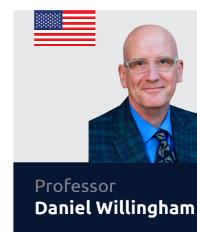
Helping Students Regulate Their Learning