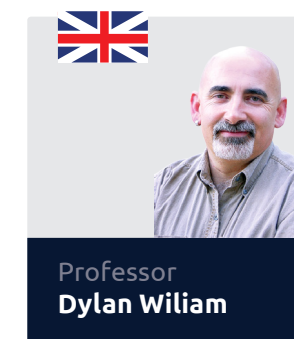
Curriculum, Pedagogy and Assessment