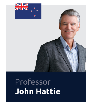
Top 10 Learning Strategies