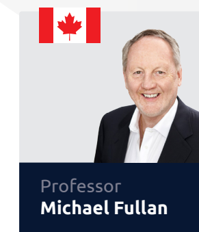
Why Some Leaders Succeed and Others Fail